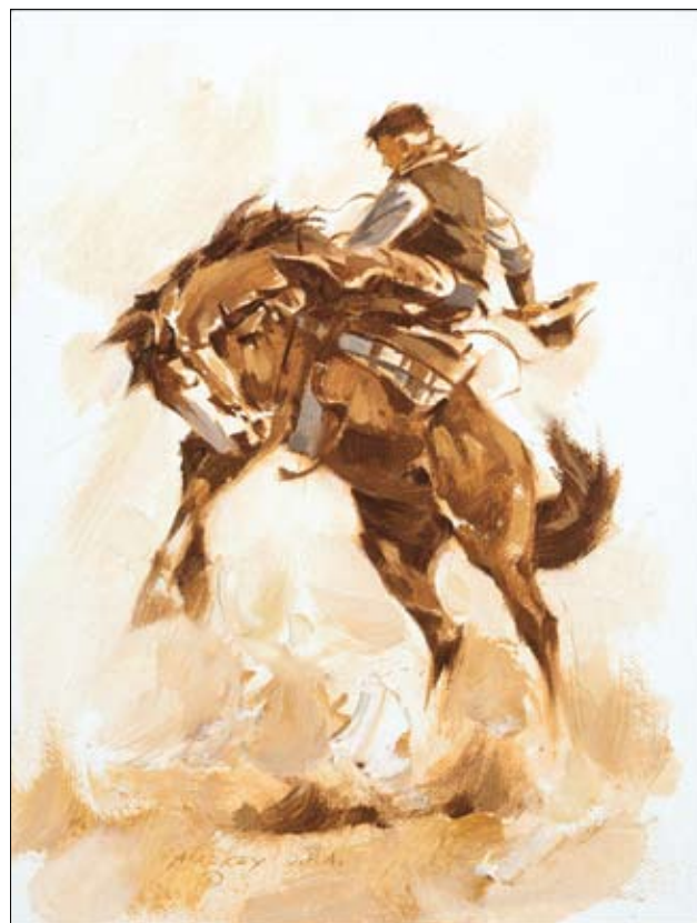
Bone Cracker , oil, 8 x 6"