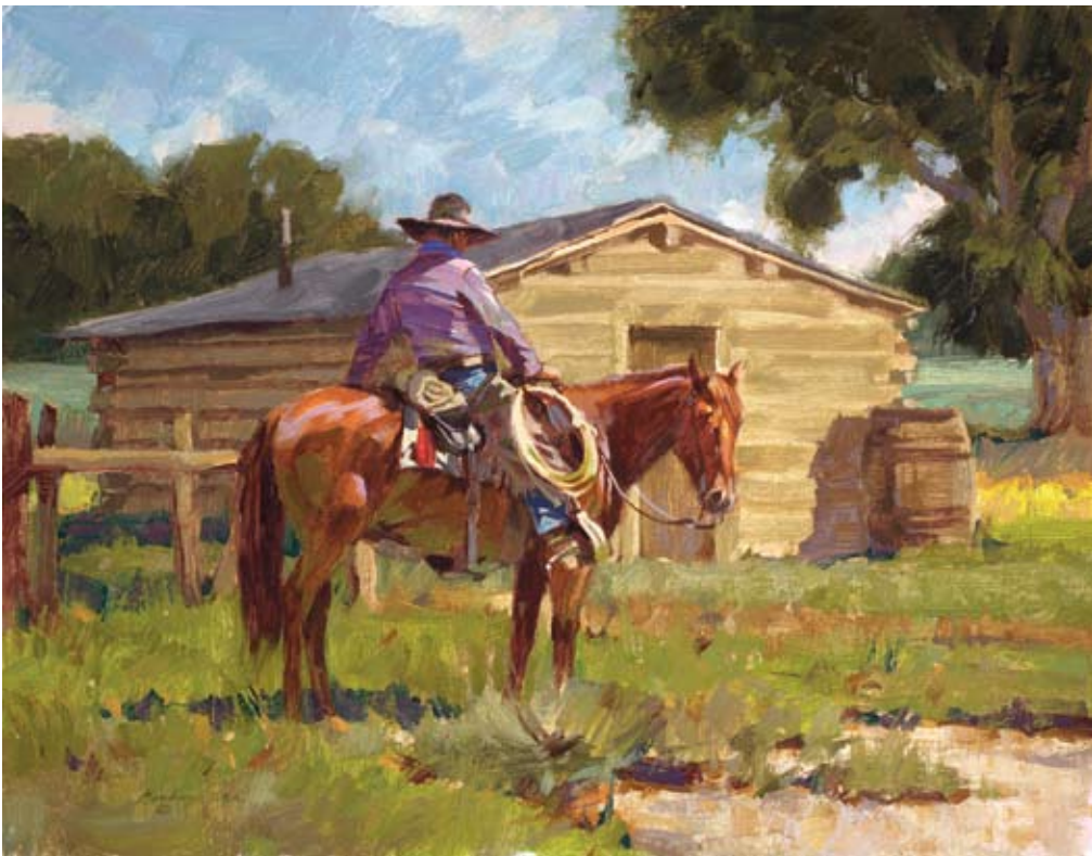
Monte Vista Camp , oil, 14 x 18"