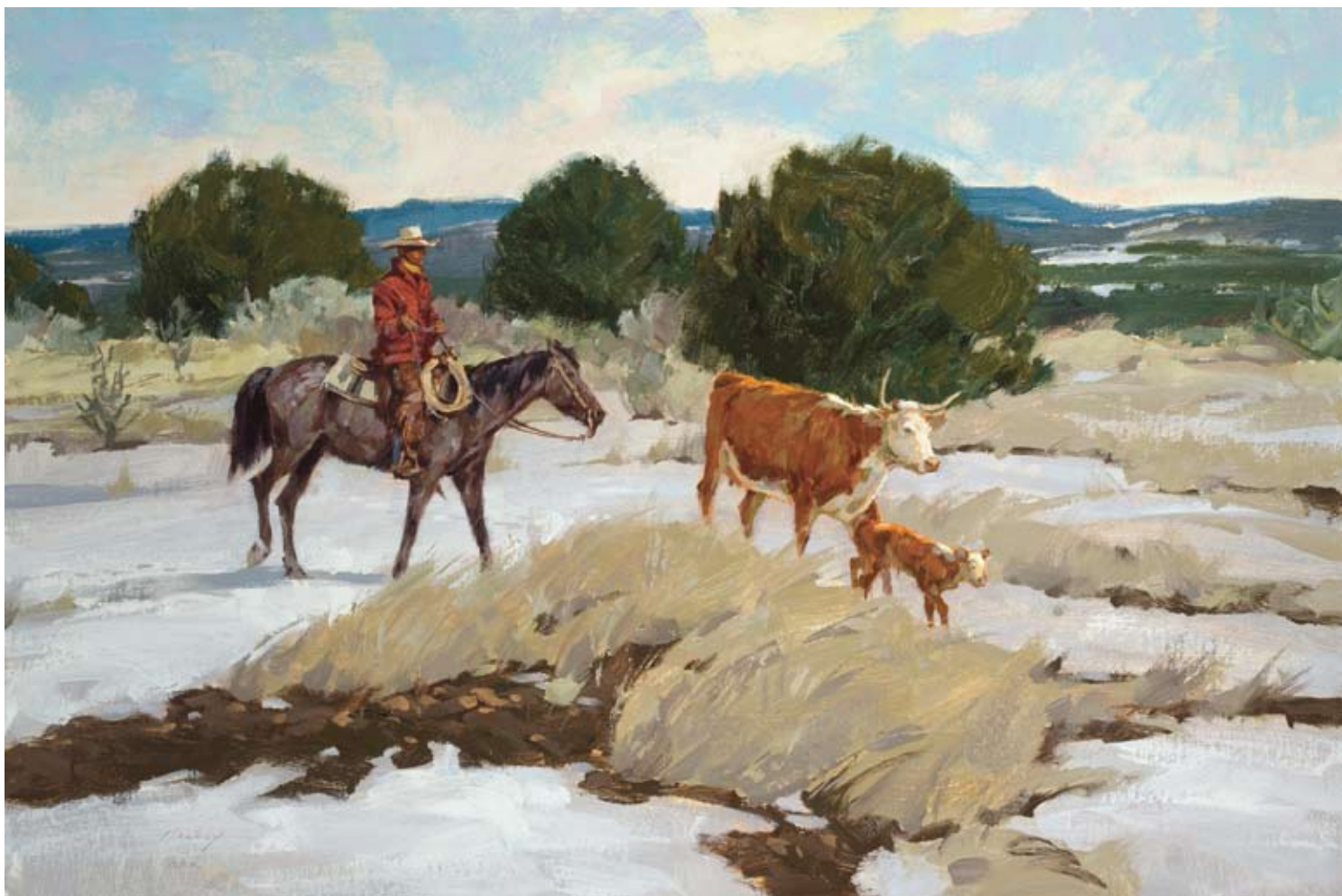
Too Small, Too Early, Too Cold , oil, 20 x 30"