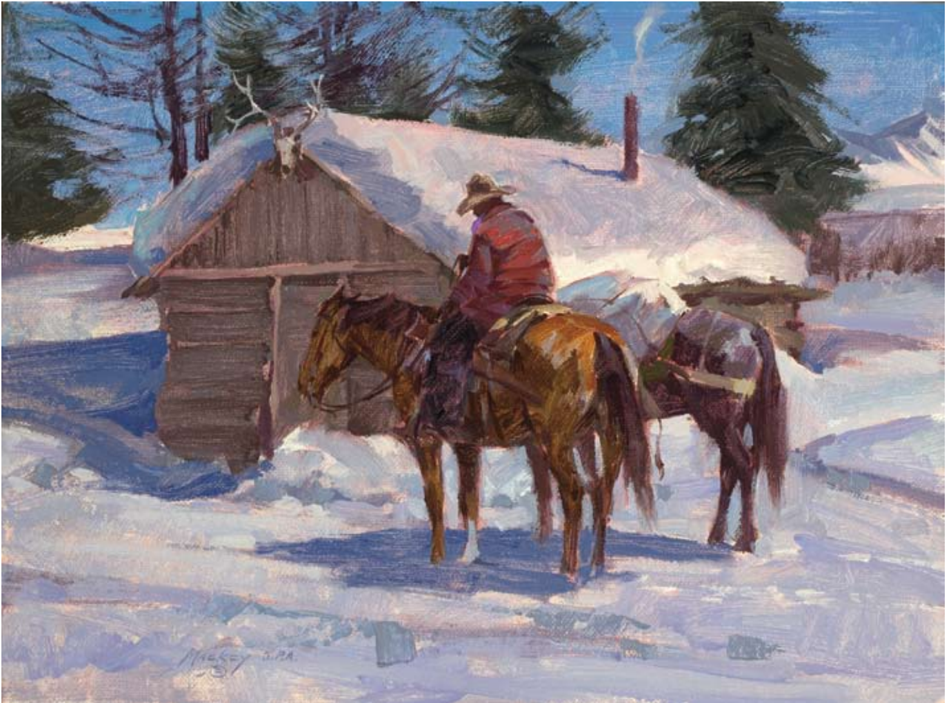
Drifts , oil, 9 x 12"

light on a horse's back, a distant blue mesa, a hawk in the sky. I'm continually inspired to do the kind of work I do and these paintings are just part of that."