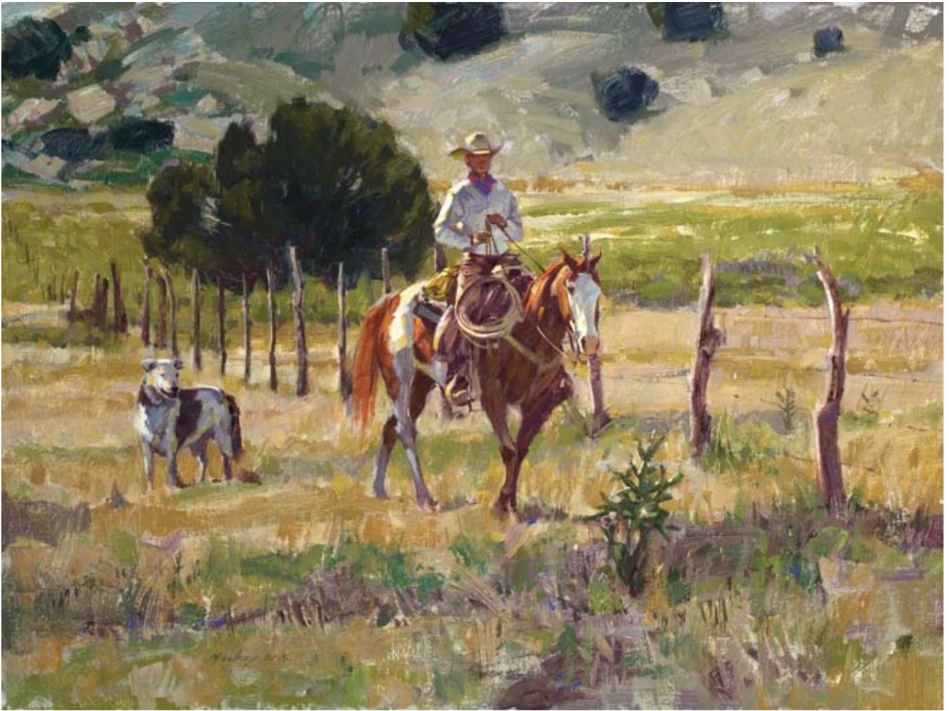
Fence Line , oil, 18 x 24"