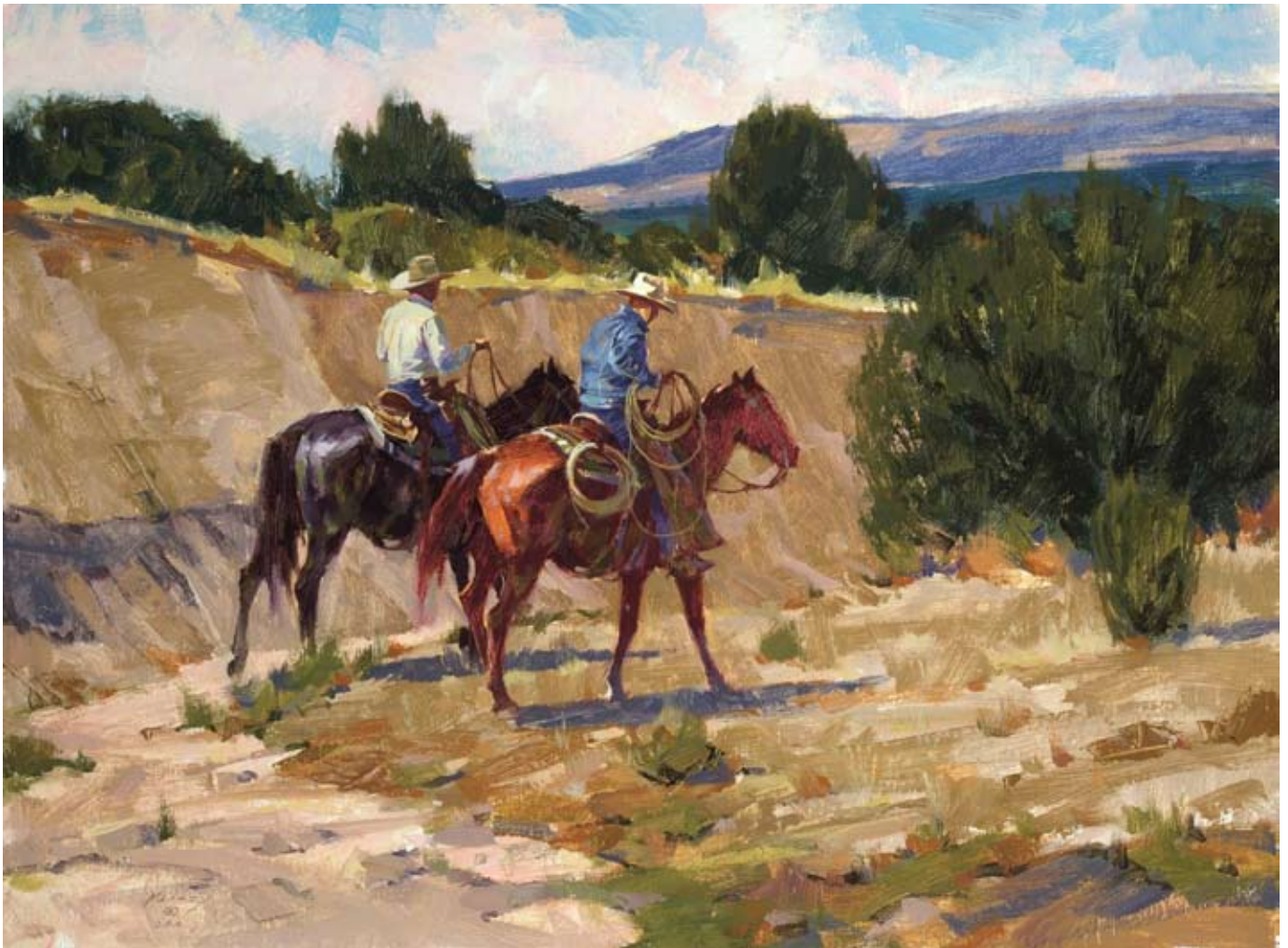
Tracking Outlaw Cattle , oil, 18 x 24"

"Inspiration for me is a constant thing. It's not an epiphany; it's a continual daily stream," explains Mackey. "I'm always looking at the